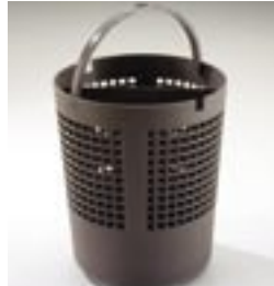
Extended Instrument Basket 219296