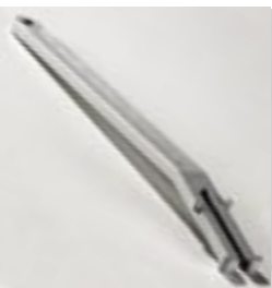
Lifting Device 219294