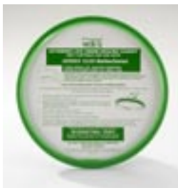
2100 Classic Sealing Gasket 219500