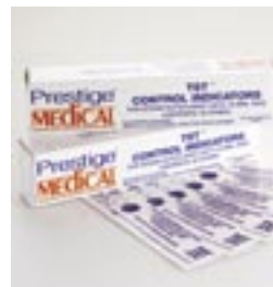
TST Indicator Strips 219277 126°C 259277 121°C