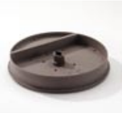
Instrument Tray Classic 219293 Omega 229310