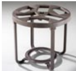
Cassette Rack Classic 219290 Omega 249025