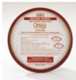
Omega Sealing Gasket 229216