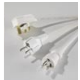
Cord Sets UK 219258 Euro 219297 UL 219299