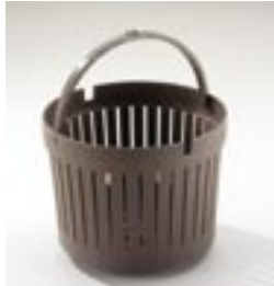
Standard Instrument Basket 219292