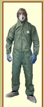
BIOLOGICAL PROTECTION SUIT (M2737)

From the moment the call came in L E West's team of Pharmacists were designing and sourcing the most effective equipment, consumables and drugs for inclusion in the Pandemic Flu Packs.